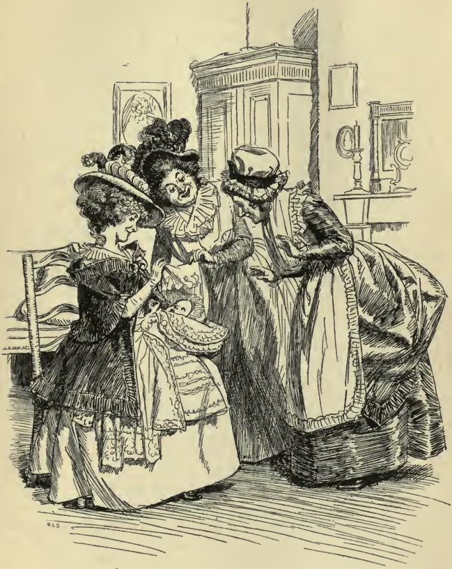
Showing her child to the housekeeper.